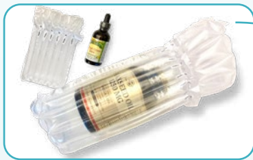
Air Cushioned Pouches

Pregis offers an array of paper and poly solutions to provide the right prescription of cushioning and containment to protect and enhance the value of your diverse product lines. We also design our packaging with mother nature in mind, offering materials with recycled content and recyclability to support your sustainability goals – and your customers.